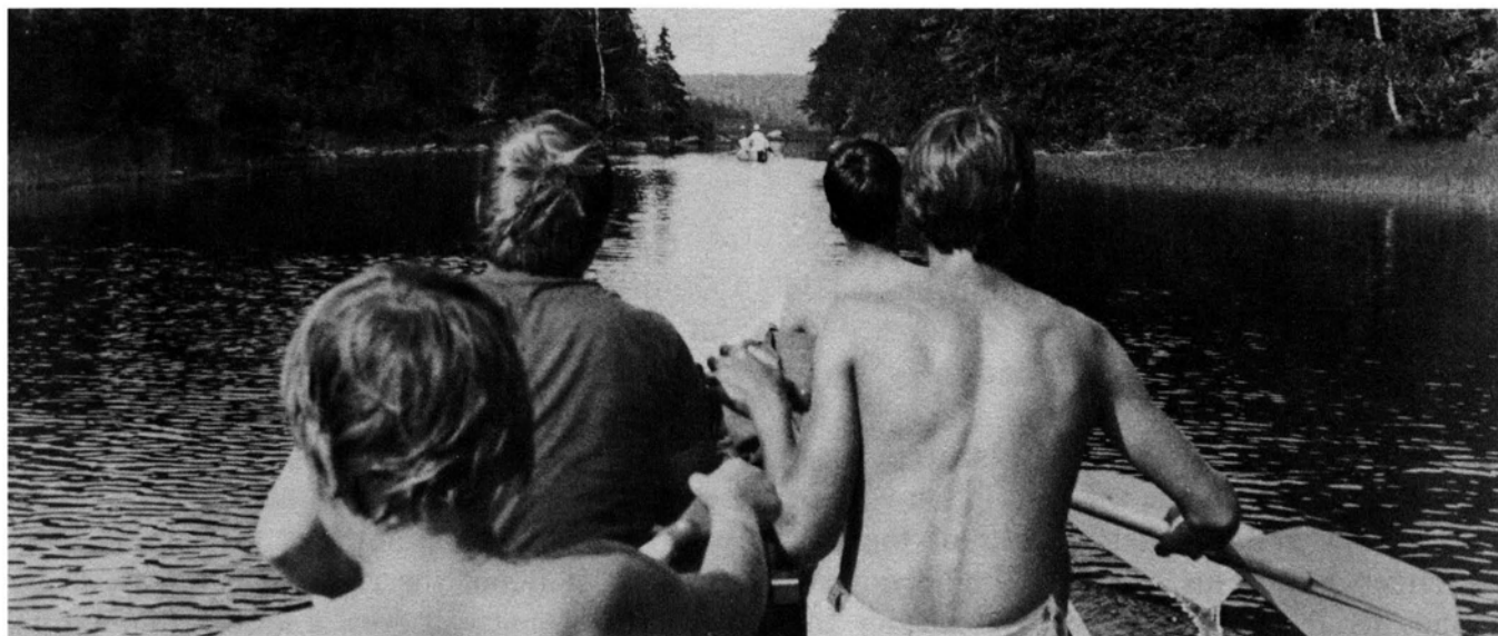
Just as teamwork is necessary for a canoe to go forward in the right direction, so teamwork between members of God’s Church is necessary to do God’s Work today.

Among the first disciples Christ called were Andrew and his brother, Simon. Andrew was a disciple of John the Baptist. One day he and a companion were with John when Jesus walked by them. “Behold the Lamb of God!” said John the Baptist (John 1:36). Andrew and his companion knew that John had always said he