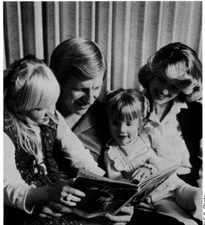
By emphasizing strong marriages and close family relationships, God's Church is preparing us to become a part of God's family.

Throughout his ministry John the Baptist emphasized that he was only preparing the way for One to come; One much greater than he. Notice this in Mark 1:7-8: "And John preached, saying, There cometh _____